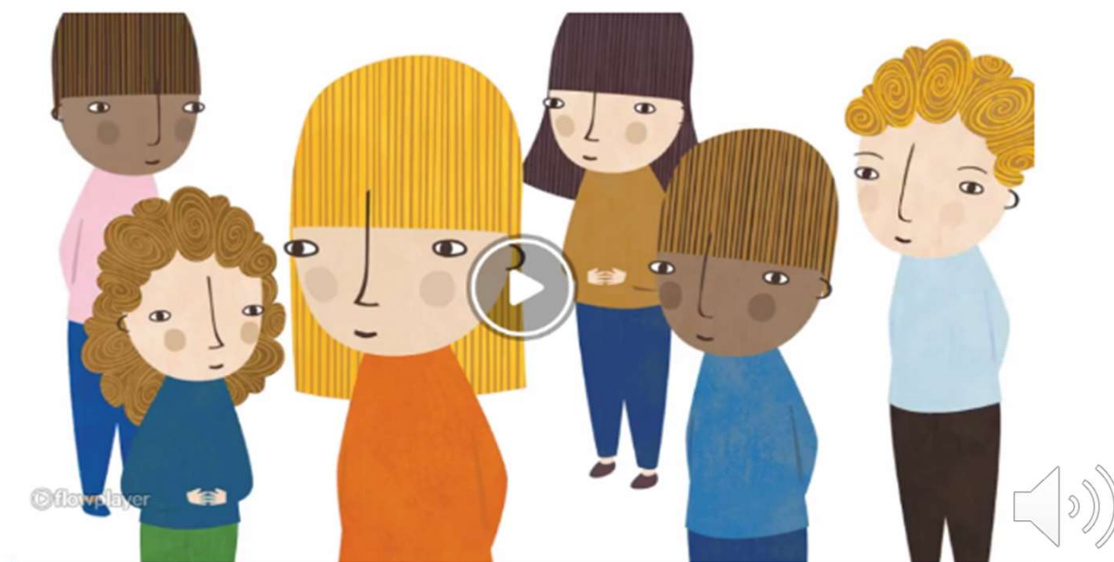
Video: Identifying signs of abuse